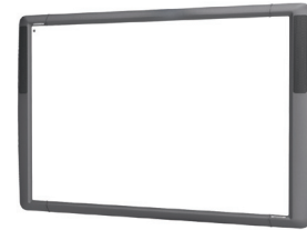
ActivBoard 500 Pro